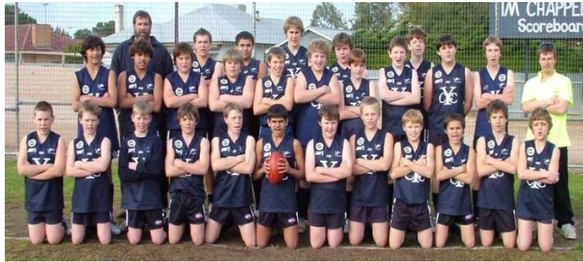
Cougars Junior Colts.