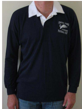
Rugby Top $40.00