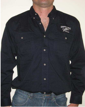
Drill Shirt $30.00