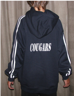
New Kids and Adults Hoody $ 49.95