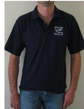
Polo T Shirt $20.00