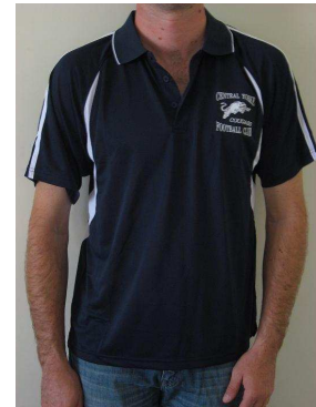
Stripe Insert Polo Shirt $30.00